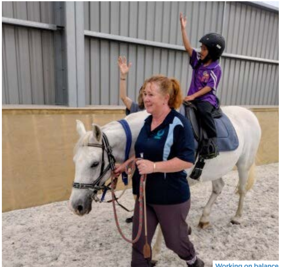
Working on balance