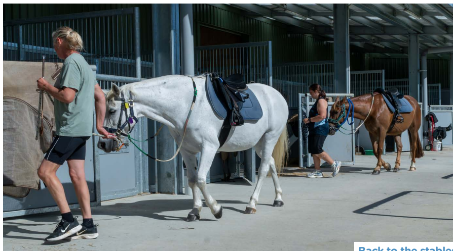
Back to the stables

"We were at a point where we didn't know how to get the project through to final completion. [Aktive's advocacy], and Auckland Council's support brought the confidence and momentum that was necessary to push the project forward."