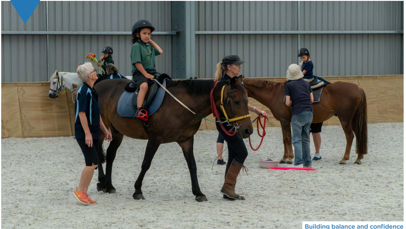
Building balance and confidence