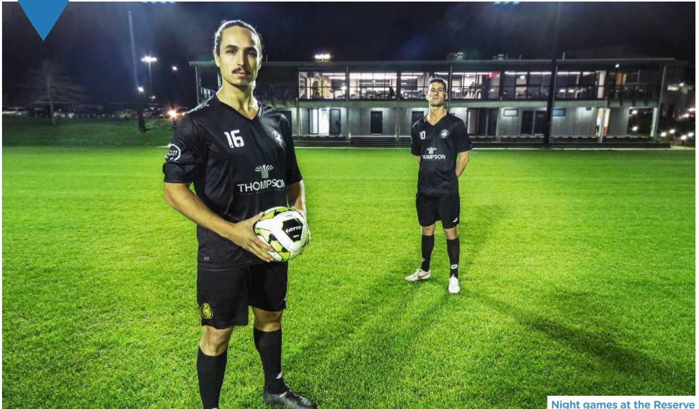
Night games at the Reserve