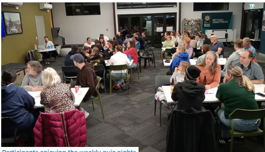
Participants enjoying the weekly quiz nights