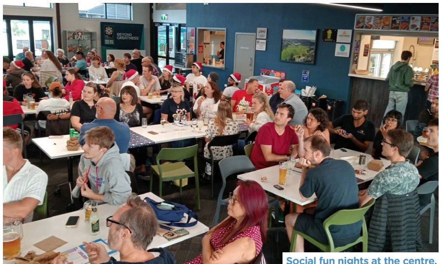
Social fun nights at the centre.

“What we’re really seeing is the wider community becoming more cohesive around the Centre. It’s becoming more than just a sports hub.”