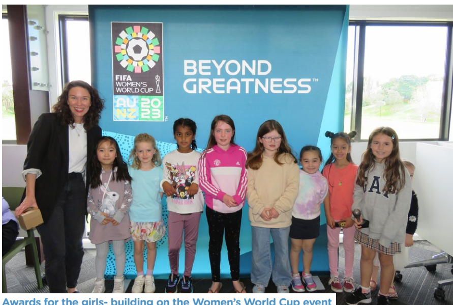
Awards for the girls- building on the Women's World Cup event

“Our catchment is incredibly diverse, and we're already seeing more cultures and groups come through the doors. I want people to think of the Centre first whenever they need a venue – and I want us to be fully sustainable without relying on grant funding. That's the goal.”